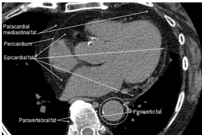
FIG. 1. A view of the human heart on an axial CT scan showing the location of fat around the epicardium, paracardial mediastinum, descending aorta, and paravertebral region.

In general, the most metabolically active BAT region based on calculations of maximal standard uptake values ( SUV_{max} ) of the FDG tracer is the supraclavicular fossa and axilla followed by the mediastinal, thoracic paravertebral, perinephric, and adrenal loci (1,5). The minimum threshold for uptake and therefore the detection limit for the tracer in BAT has been defined as 2 SD above the maximal SUV distribution in typical WAT (9,10) and varies between \geq 1 (10) and \geq 2 g/mL (9,10,15,16). These values serve as the criterion for the presence (PET + ) or absence (PET - ) of BAT in any given site. Its limitation is that a region of interest such as the neck can be PET - but still exhibit islands of brown adipocytes containing specific uncoupling protein (UCP)1 histologically (15) suggesting the PET-CT is not always detecting metabolically active BAT. This could relate in part to the radioactive FDG substrate adopted, as it is clear that although the radio density of 11 C acetate, an alternative tracer of intermediary